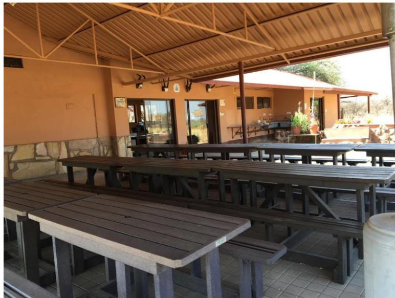
Hot Spot Dining Area

Meals are eaten at an open-air dining pavilion called the 'Hot Spot'. CCF has full time cooks that prepare lunch and dinner meals. In addition, staff and Intern/Working Guests prepare their own breakfast. The menu is quite similar to western food (pastas, rice, meat, salads, and vegetables) and vegetarians can be catered for; if you are a vegetarian, please inform the hospitality Manager once you have arrived at CCF. Water is safe to drink from the tap. Tea, coffee, hot chocolate and concentrated juices are provided. Sodas and a small selection of snacks are also available for purchase in our gift shop.